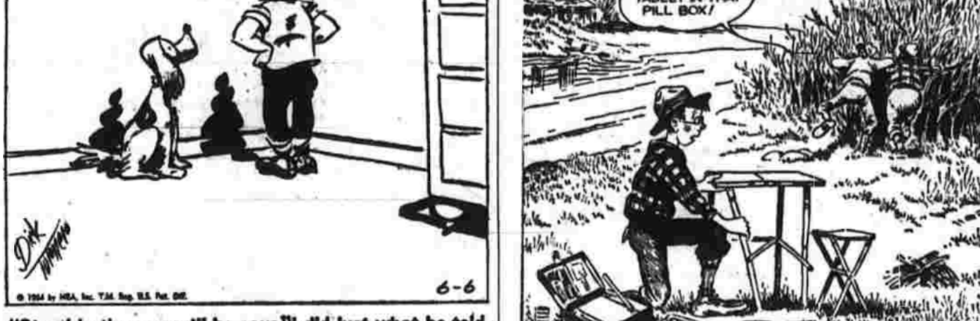
OUT OUR WAY