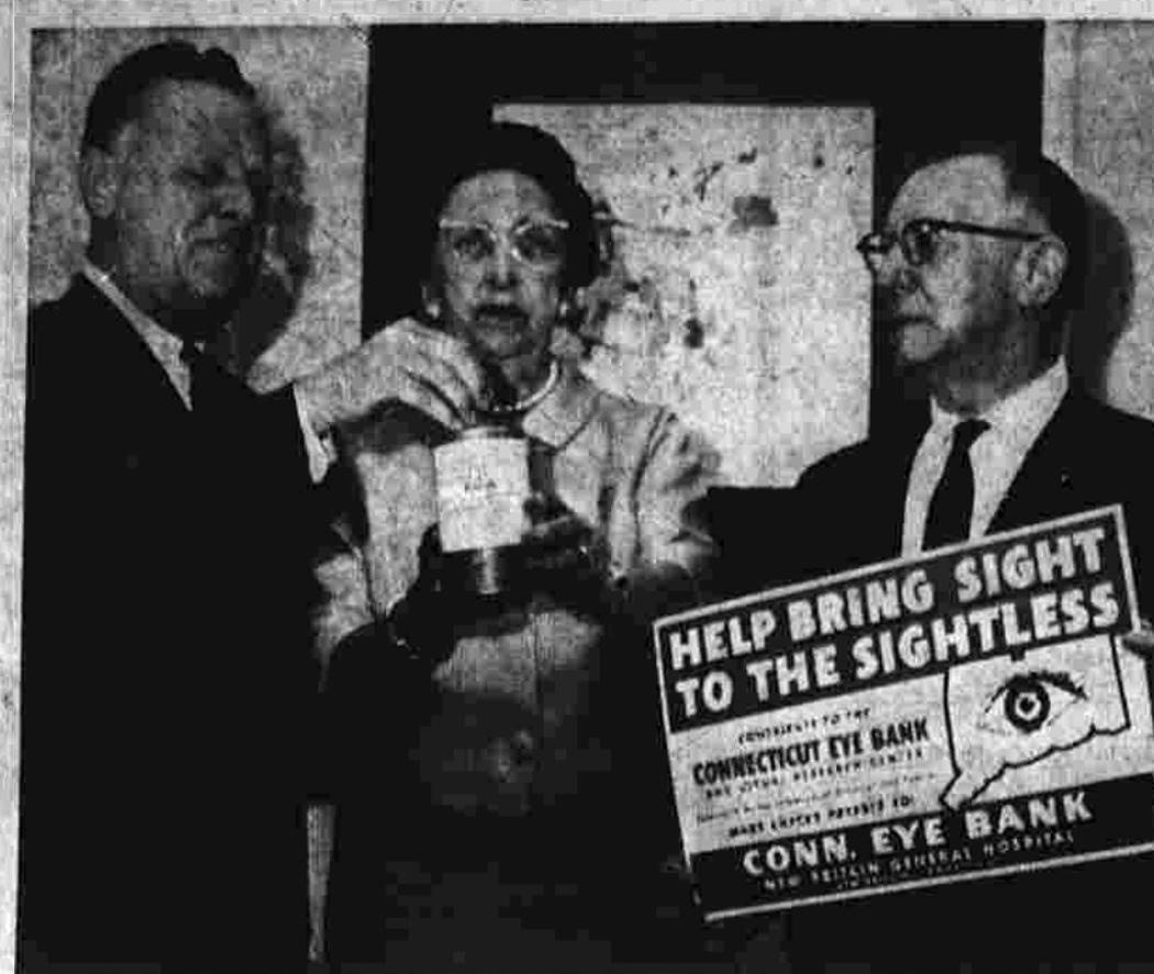
Contributing Toward a Sighted Future

Members of the Manchester Garden Club are reminded that tonight is the last opportunity to make reservations for the dinner meeting to be held at 7 p.m. Monday at Miller's Restaurant for a dinner meeting.